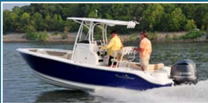
Note: Boat shown with optional outboard power.